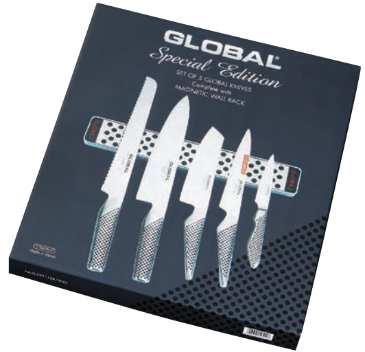
G-2951138/M30 Set of 5 GLOBAL knives with magnetic knife rack