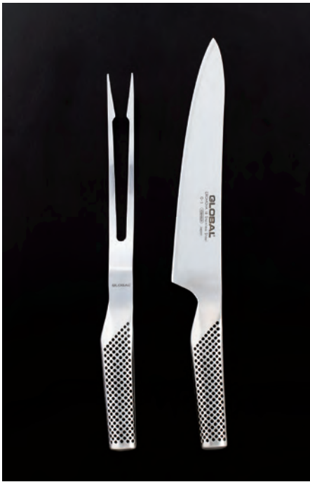
G-13 G-3 G-313