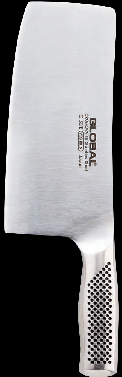
G-50/B Heavy weight 580g=4.0mm Chop & Slice Chinese knife