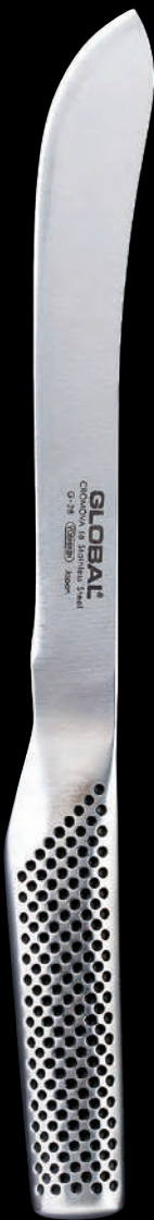
G-28 Butcher • 18cm