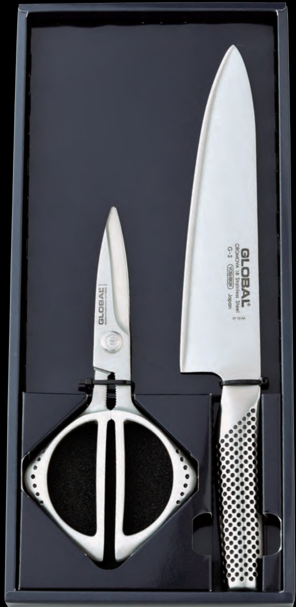
G-2210 Cook's knife and Kitchen shears set