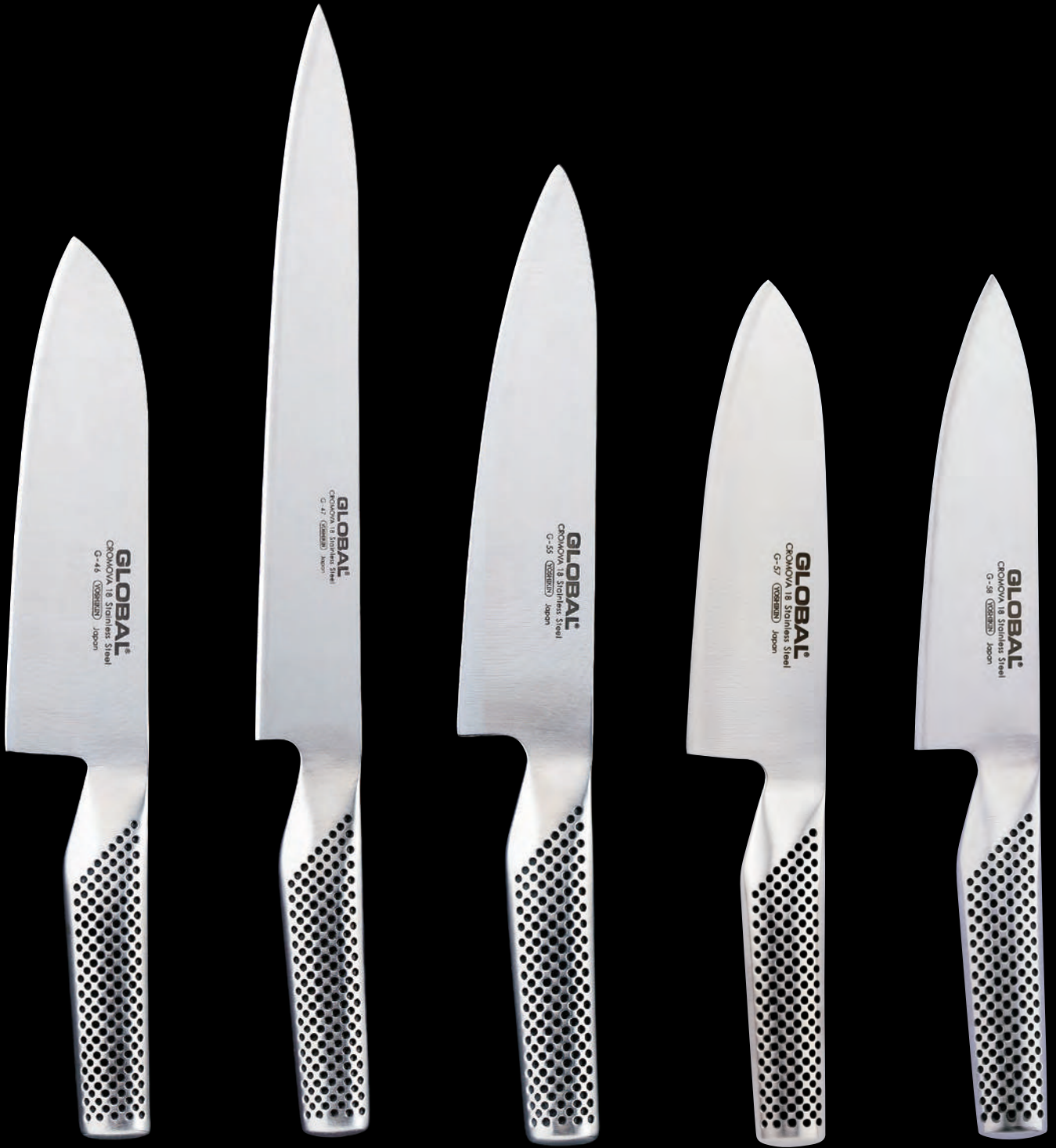
G-46 SANTOKU knife • 18cm