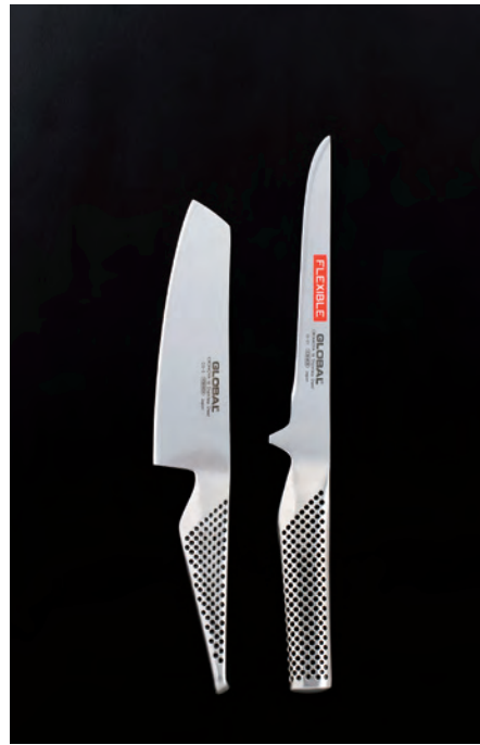
GS-5 G-21 G-215