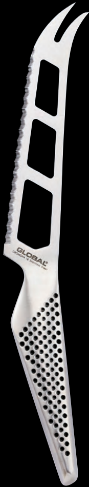
GS-10 Cheese • 14cm