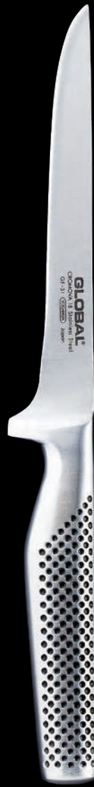
GF-31 Boning • 16cm