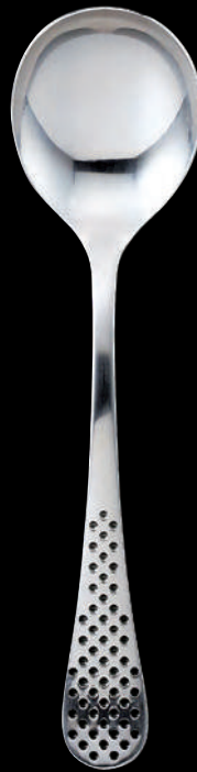
GT-008 Soup spoon