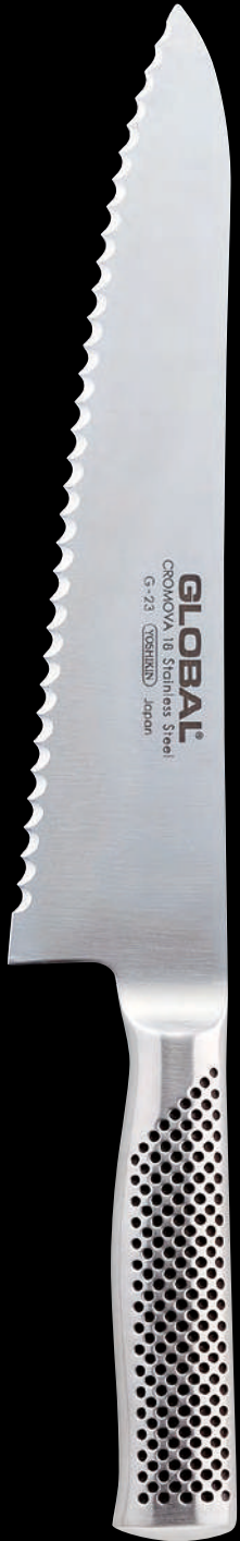
G-23 Bread • 24cm