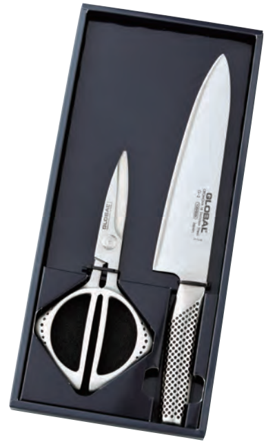
G-2210 Cook's knife and Kitchen shears set