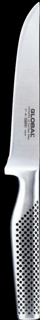
GF-40 Boning Wide • 15cm