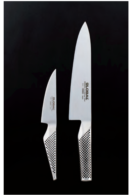
GS-1 G-2 G-201