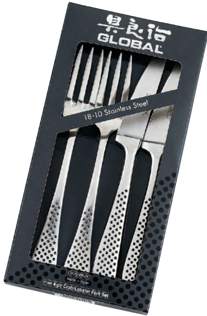
GT-102 4-pc. Steak knife and fork set