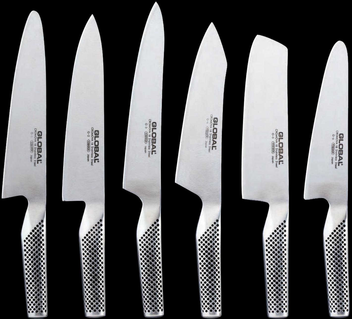
G-1 Slicer • 21cm