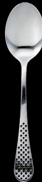
GT-004 Large teaspoon