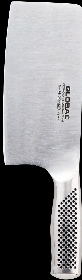
G-49/B Light weight 400g=2.5mm Chop & Slice Chinese knife