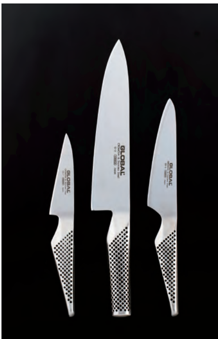
GS-7 G-2 GS-3 G-237