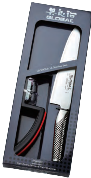
G-2220BR Cook's knife & Ceramic water sharpener set Black/Red handle