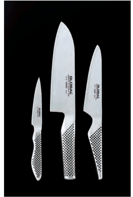
GS-38 G-46 GS-3 G-46338