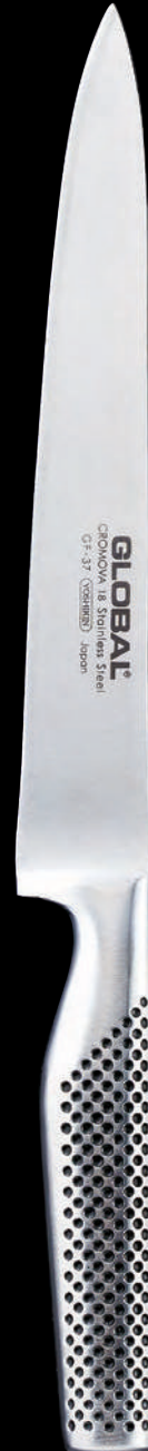
GF-37 Carving • 22cm