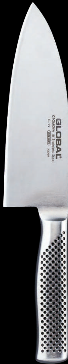
G-29 Meat/Fish • 18cm