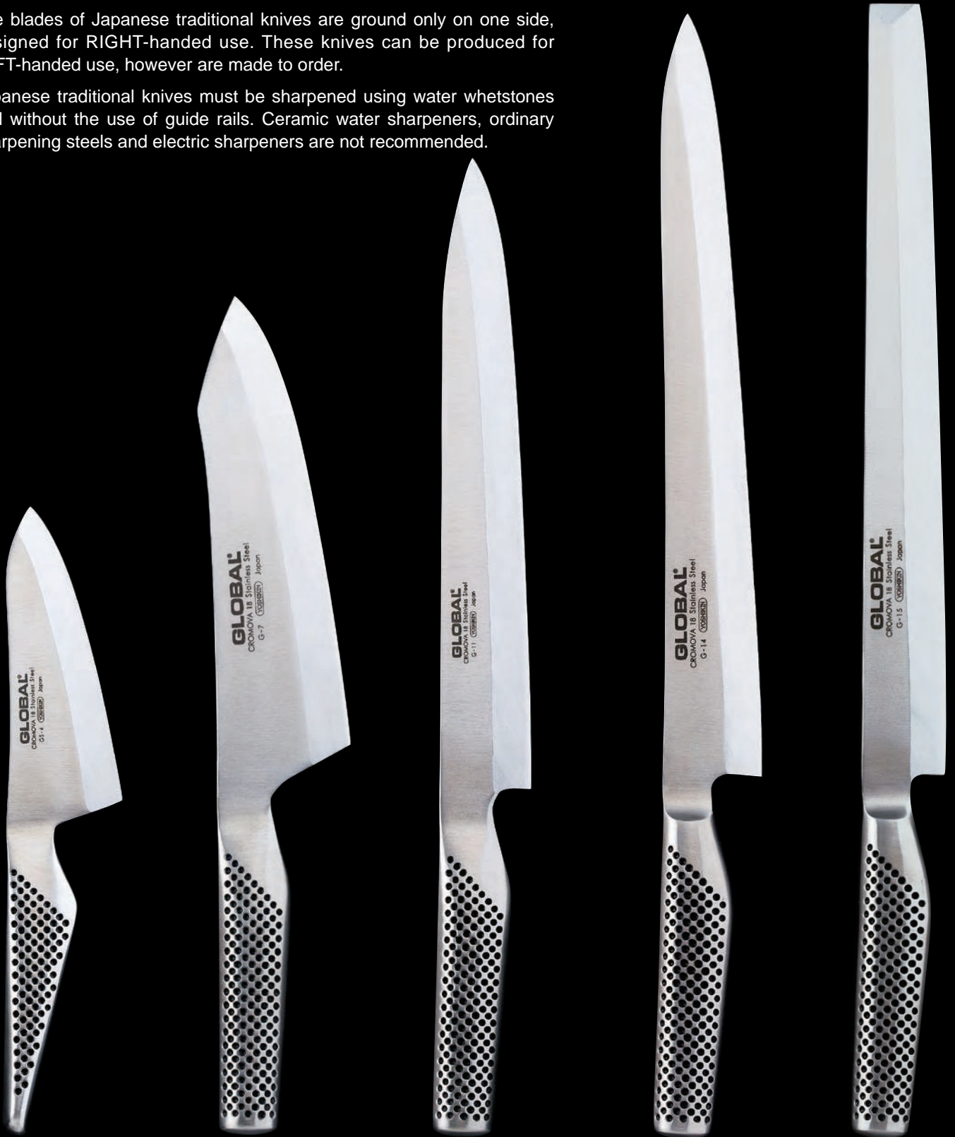
GS-4R Oriental DEBA ● 12cm

Japanese traditional knives must be sharpened using water whetstones and without the use of guide rails. Ceramic water sharpeners, ordinary sharpening steels and electric sharpeners are not recommended.