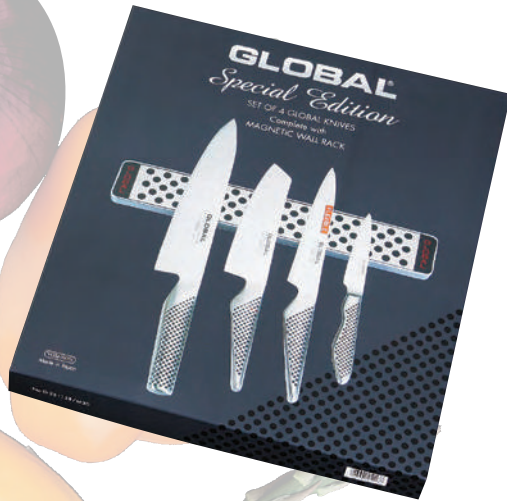
G-251138/M30 Set of 4 GLOBAL knives with magnetic knife rack