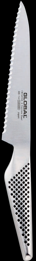
GS-14 Utility, Scallop • 15cm