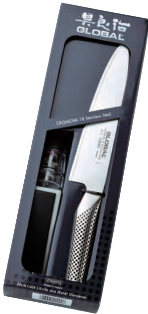
G-2220GB Cook's knife & Ceramic water sharpener set Grey/Black handle