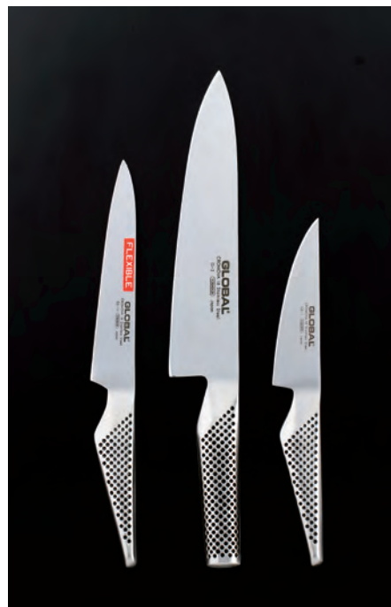
GS-11 G-2 GS-1 G-2111