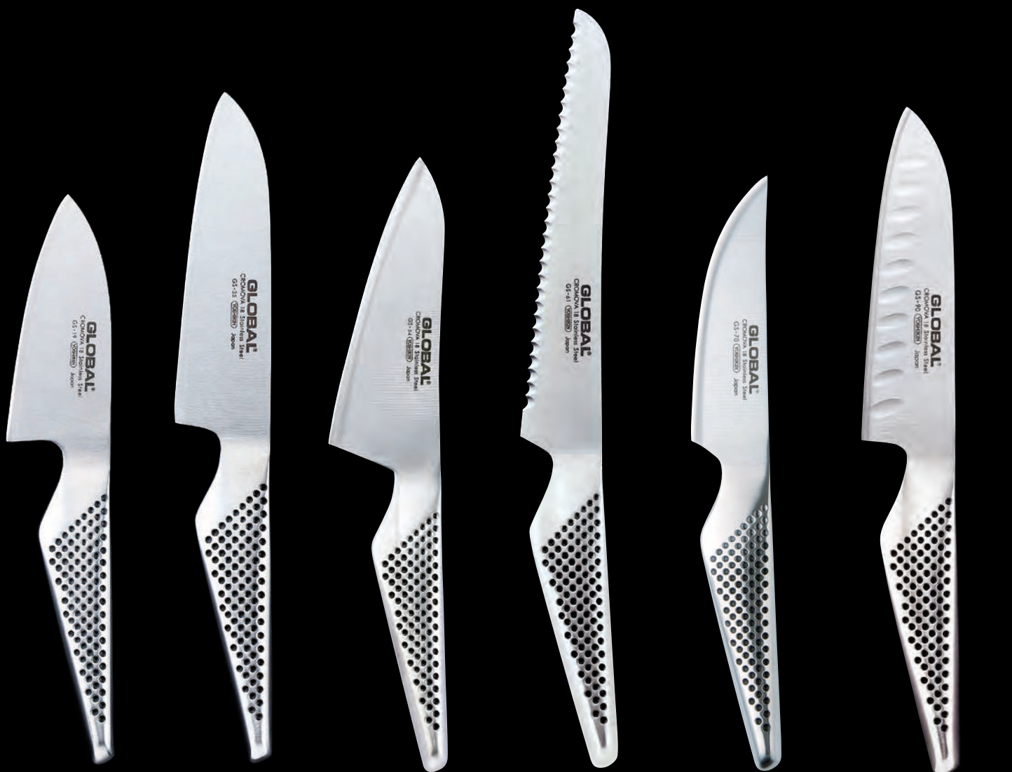
GS-19 Fish/Poultry ● 9cm