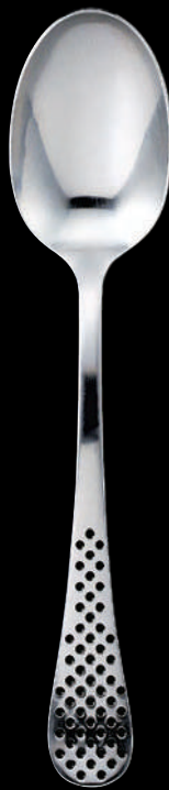
GT-007 Dessert spoon