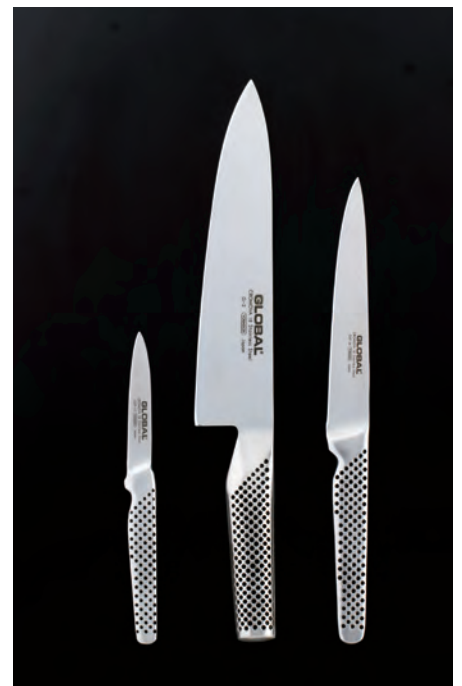
GSF-15 G-2 GSF-24 G-21524