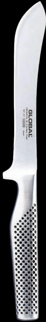
GF-27 Butcher • 16cm