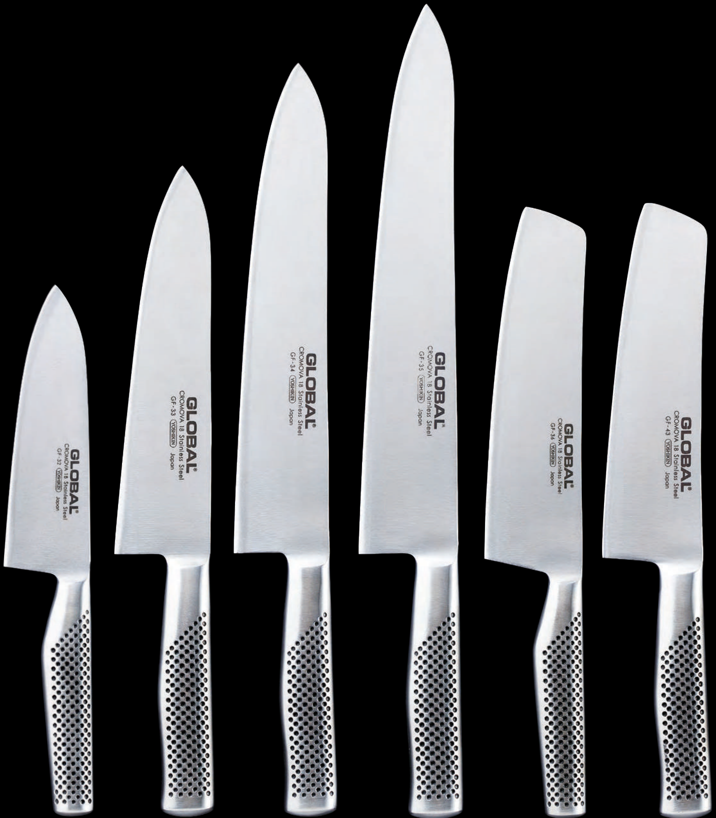
GF-32 Chef's • 16cm