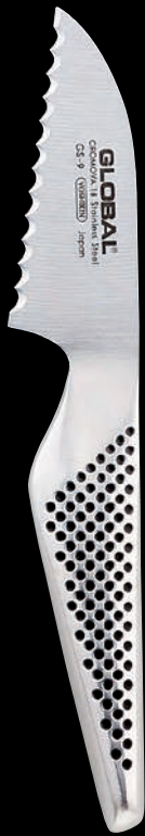
GS-9 Tomato • 8cm