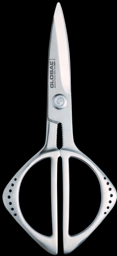
GKS-210 Kitchen shears • 21 cm