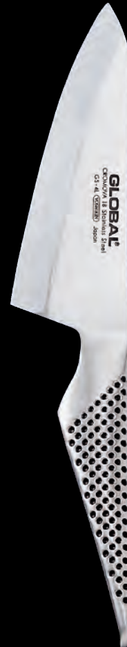
GS-4L Oriental DEBA ● 12cm