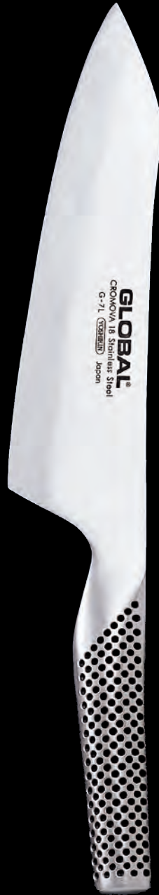
G-7L Oriental DEBA ● 18cm