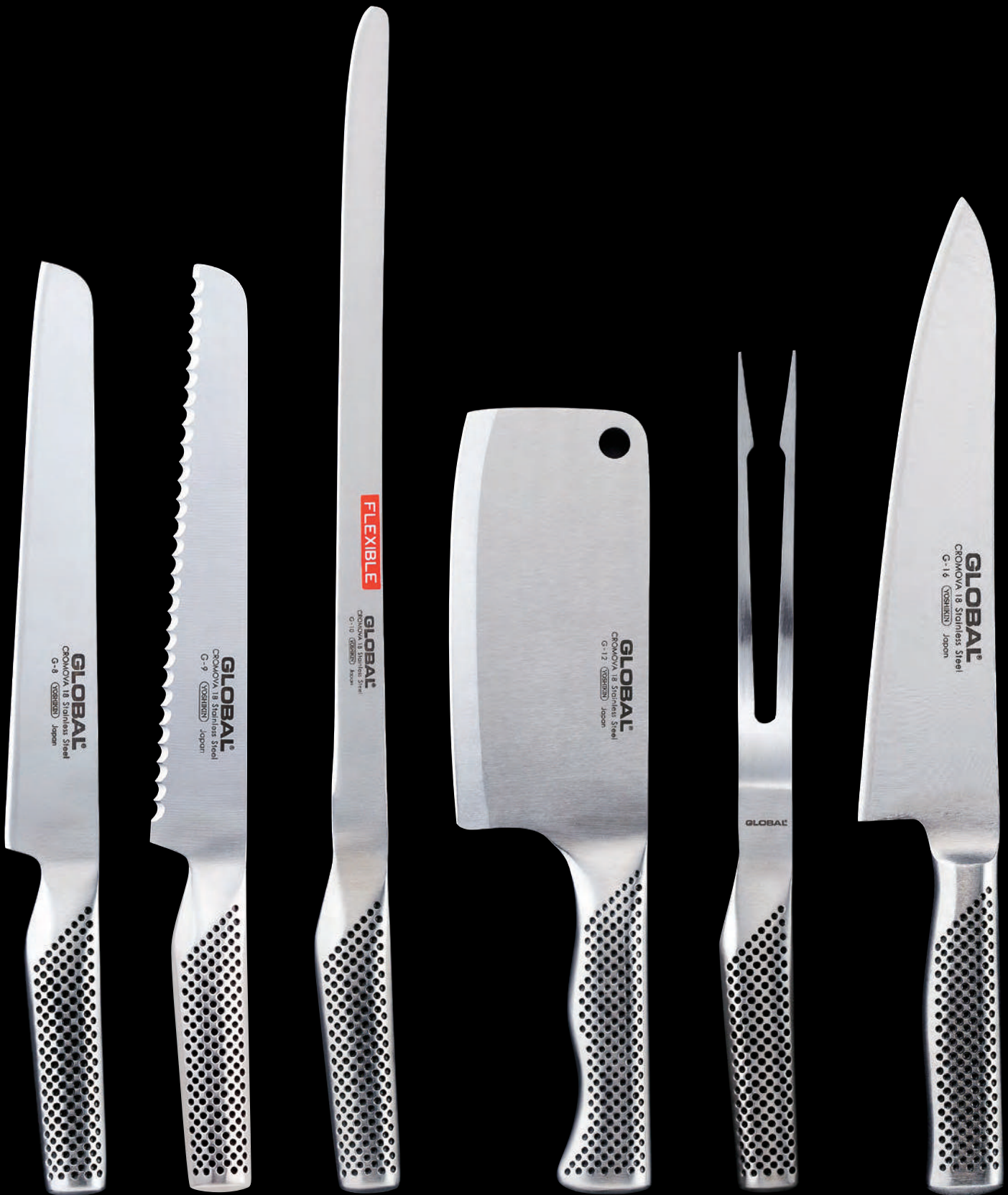
G-8 Roast Slicer ● 22cm