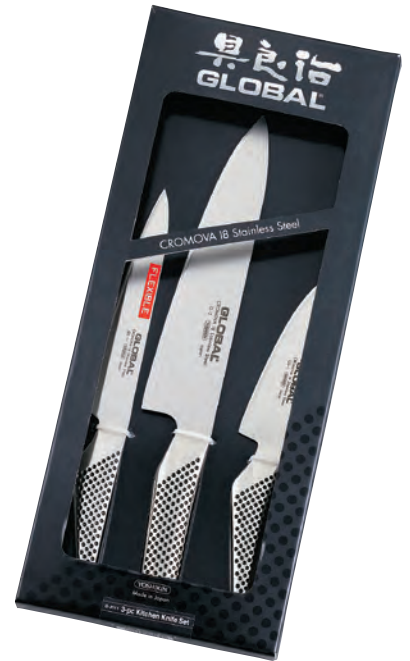
G-2111 Set box