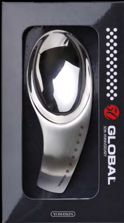
GS-80/CDU Appetiser Spoon, 12-pc in CDU