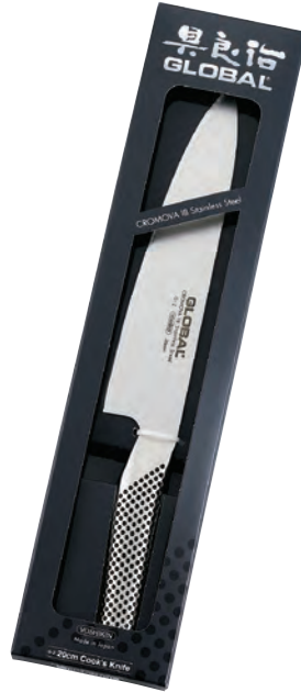
G-2 Individual box