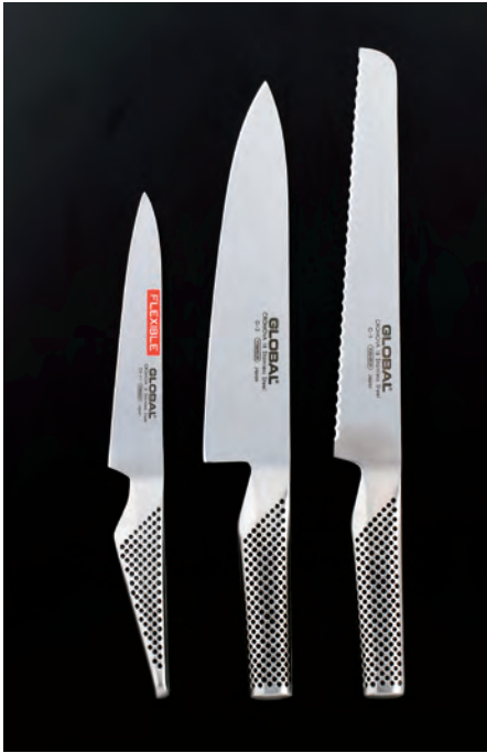
GS-11 G-2 G-9 G-9211