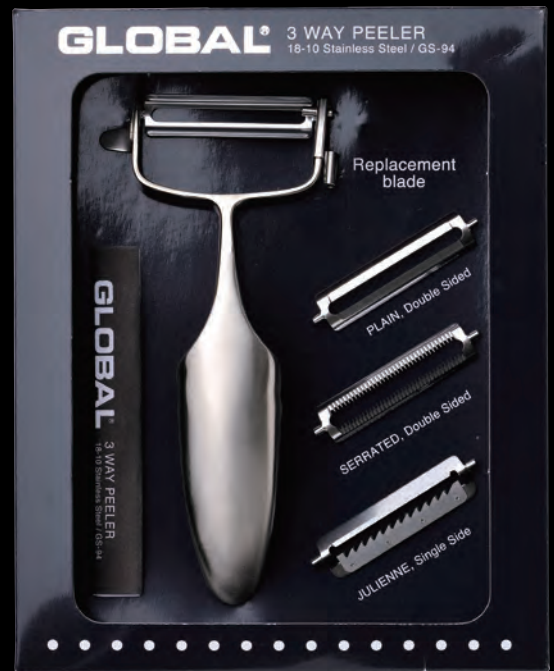
GS-94 3-way Peeler, 18-10 S/S (Plain, Serrated, julienne)