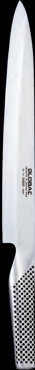
G-11L YANAGI Sashimi ● 25cm