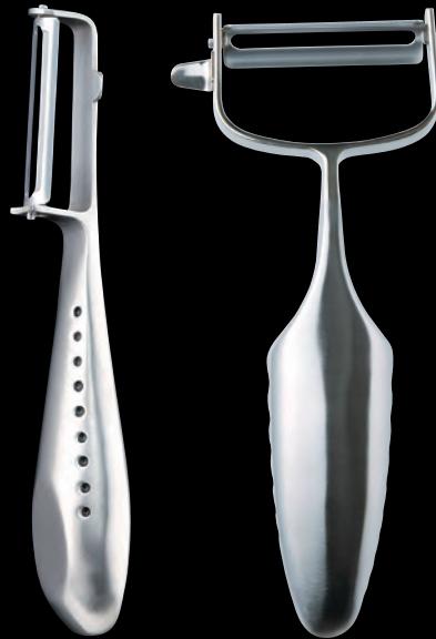
GS-76 Swivel Peeler, Plain edge ●5cm