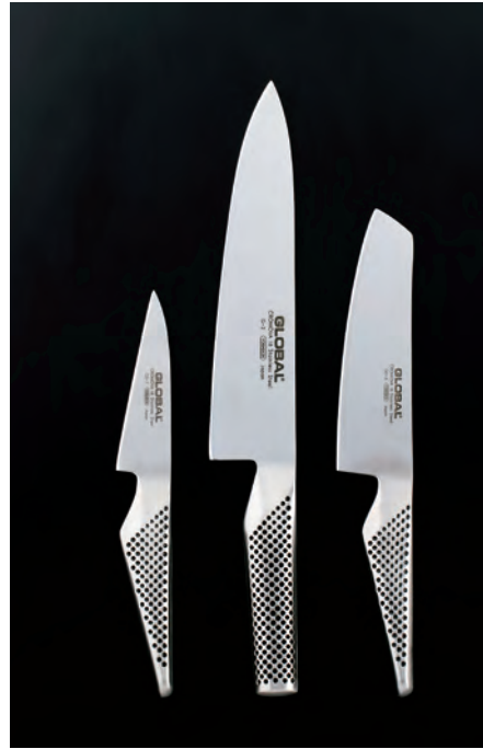
GS-7 G-2 GS-5 G-257