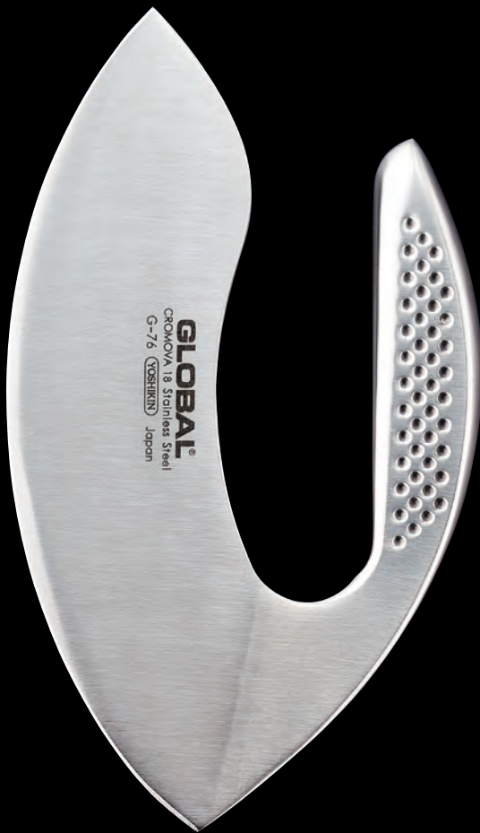
G-76 Herb Chopper